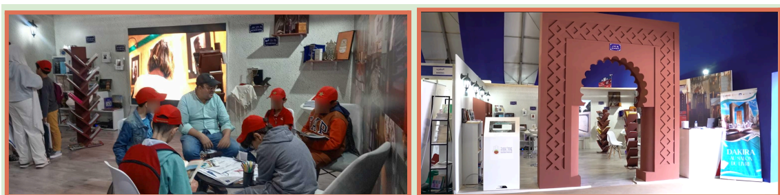
High Atlas Foundation/DAKIRA

The booth attracted 3,170 visitors, including Moroccans, foreigners, Jews, Muslims, and people of various ages, backgrounds, and beliefs. Despite regional challenges, Mimouna Association facilitated meaningful discussions on Moroccan Judaism and addressed numerous questions from curious attendees. This event not only celebrated the cultural richness of Moroccan Jews but also promoted a deeper understanding and appreciation of Morocco's diverse heritage.