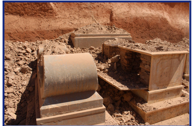
The destroyed wall of the Jewish Cemetery in Marrakech, which collapsed on several tombs. September 2023.