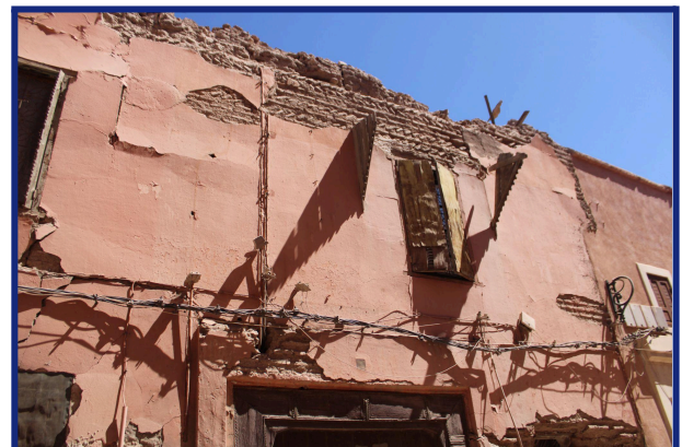
View of damage in the historic Mellah of Marrakech, following a powerful earthquake in Morocco. September 2023.