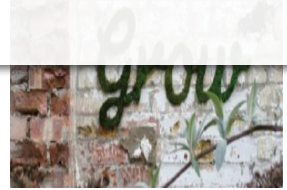
moss graffiti (RECIPE)