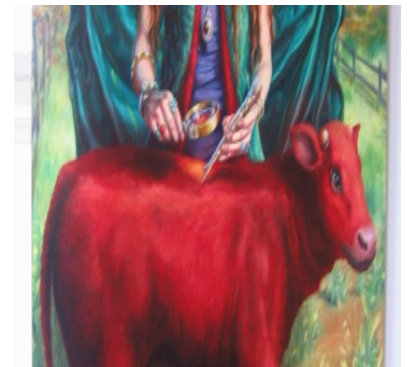
Holy cow! Prophecy fulfilled after red heifer is born at Temple of Israel