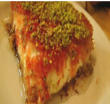
Knafeh Recipe, for the Most Fabulous Middle-Eastern Dessert