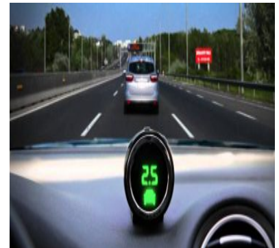
How To React When You Are In A Car Accident