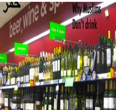
Why Muslims don't drink alcohol

To fulfill this goal, he feels he must be available to local counterparts at all times.