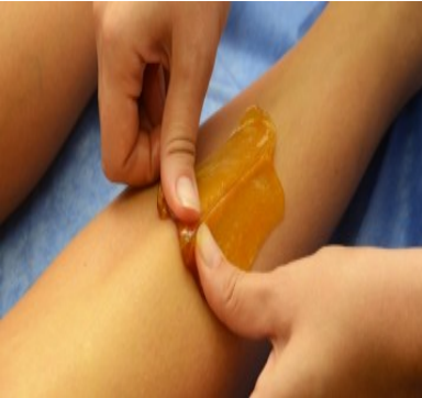
Sugar Wax – An Ancient Arabic Beauty Secret